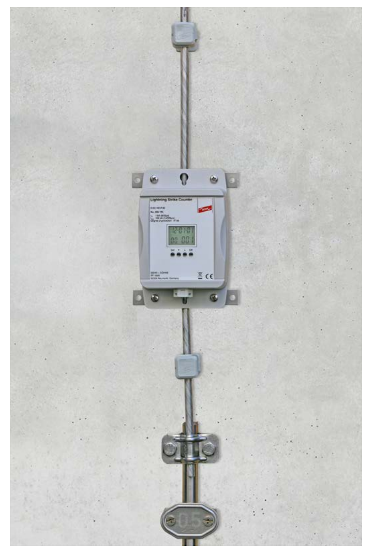
Installation on a round wire