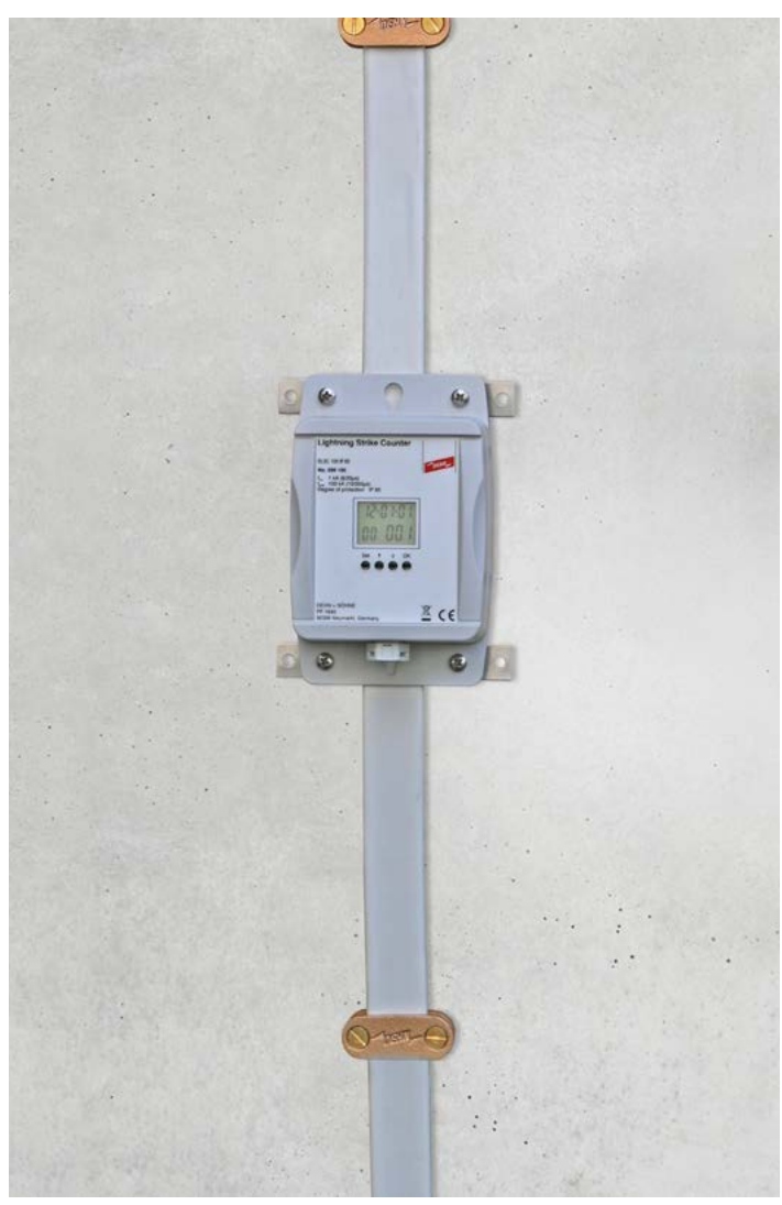
Installation on a flat strip

The lightning strike counter is suited for new and existing installations. It is directly mounted on the flat strip or round wire of the down conductor.